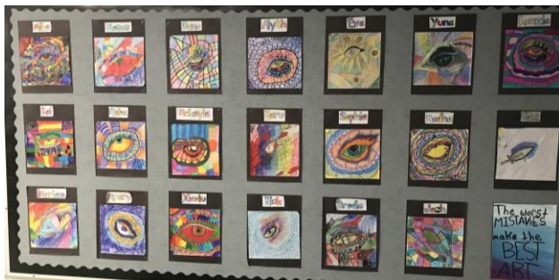
"Eye" art by students in Division 15.

We are excited to see our students developing new skills during the second half of the school year. This is evident in many of the amazing pieces of art that decorate our halls and classrooms.